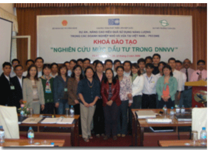
Investment Grade Energy Audits Training in Hanoi, Vietnam

With the United Nations Development Programme (UNDP) and the Global Environment Facility (GEF) assistance, IIEC has completed a comprehensive capacity building program in Vietnam focusing on the small and medium enterprise (SME) sector under the "Promotion of Energy Conservation in Small to Medium Scale Enterprises (PECSME)" project. The project was targeted in five industries · Brick, Textile, Pulp & Paper, Ceramics and Food Processing. The project goals include reduction of production costs of 10-15% in addition to GHG emission reduction resulting from energy savings.